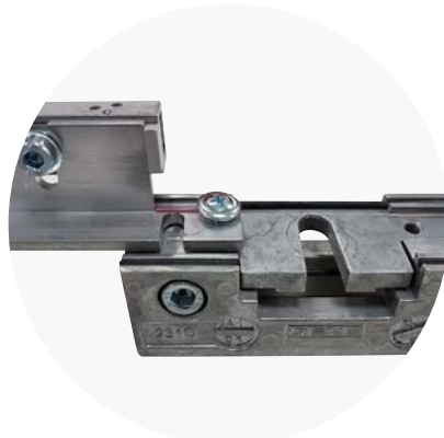
2. Fix the carrier Brackets onto the Glass Clamp.