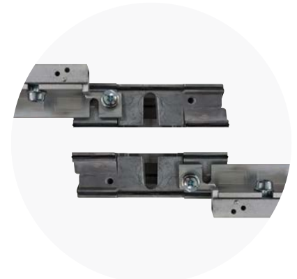
3. The Brackets are mounted the opposite way round to each other on both Doors.