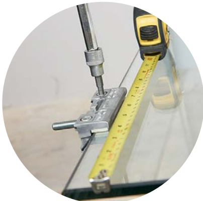
1. Fix the gear Brackets 80mm from edge of the Doors.

IMPORTANT If using a Soft Close mechanism ensure the Brackets line-up with the Soft Close roller Cassette.