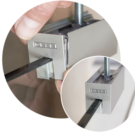
STEP 8 Select the right end cap to suit the glass thickness. Cut the section out to enable the cap to slide over the glass and clip onto the end of the clamp.