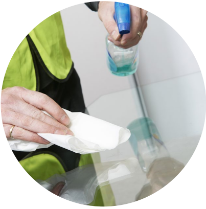
STEP 4 Clean the glass leaf.