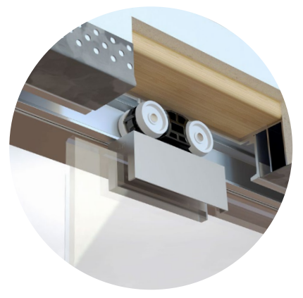
STEP 9 Carefully stand the door up and hang the door by hooking the clamps onto the roller bolts. (Cut-away image for illustrative purposes only).