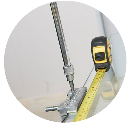
STEP 6 Fit the clamps 150mm from the edge of the leaf to the centre of the clamp.

IMPORTANT If using a soft closer mechanism ensure the glass clamps line up with the soft closer roller cassette. If using a simultaneous opening mechanism please install the clamps in conjunction with the simultaneous opening instructions.