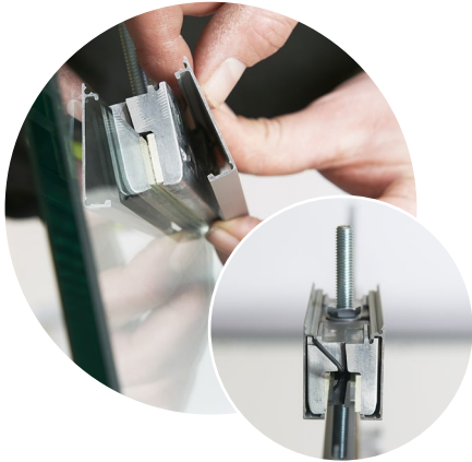
STEP 7 Fit the cover plates by hooking them on the top and pressing down until they click into the place against the glass.

IMPORTANT If using a soft closer mechanism ensure the glass clamps line up with the soft closer roller cassette. If using a simultaneous opening mechanism please install the clamps in conjunction with the simultaneous opening instructions.