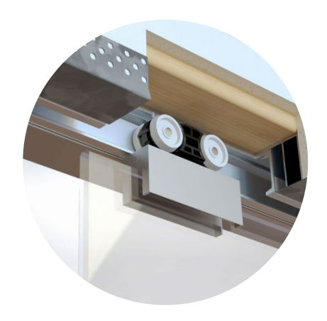
STEP 9 Carefully stand the door up and hang the door by hooking the clamps onto the roller bolts. (Cut-away image for illustrative purposes only).