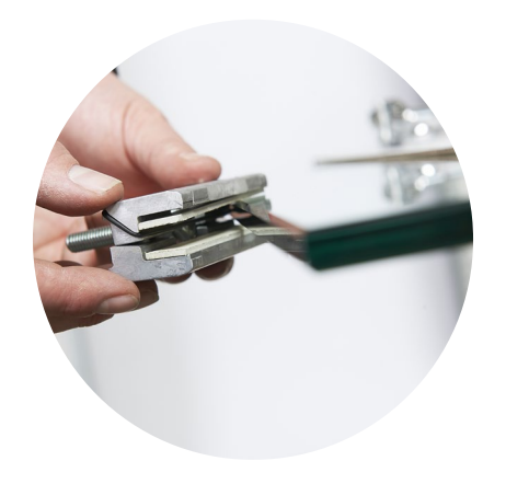
STEP 5 Place the clamps on the glass leaf and tighten the bolts.