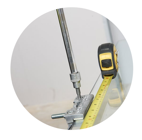
STEP 6 Fit the clamps 150mm from the edge of the leaf to the centre of the clamp.

IMPORTANT If using a soft closer mechanism ensure the glass clamps line up with the soft closer roller cassette. If using a simultaneous opening mechanism please install the clamps in conjunction with the simultaneous opening instructions.