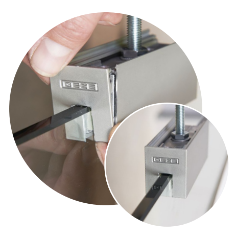
Select the right end cap to suit the glass thickness. Cut the section out to enable the cap to slide over the glass and clip onto the end of the clamp.