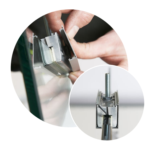
STEP 7 Fit the cover plates by hooking them on the top and pressing down until they click into the place against the glass.

IMPORTANT If using a soft closer mechanism ensure the glass clamps line up with the soft closer roller cassette. If using a simultaneous opening mechanism please install the clamps in conjunction with the simultaneous opening instructions.