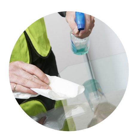
STEP 4 Clean the glass leaf.